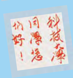
MoXi drawings by elderly