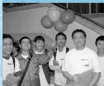
CS teams achieved good results at the Manila (top) and Guangzhou (bottom) contests.

The ACM International Collegiate Programming Contest was founded in 1970 to assist the development of top students in the computer science field. The competition comprises four different rounds: local, preliminary, regional and world finals.