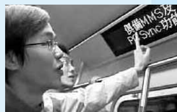
Using LED display panels in advertising has become very popular.

http://www.rthk.org.hk/rthk/tv/undergrads/20040118.html