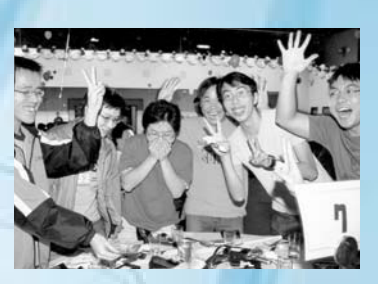
A memorable night for all of us.

Alumni playing exciting games at the homecoming dinner!